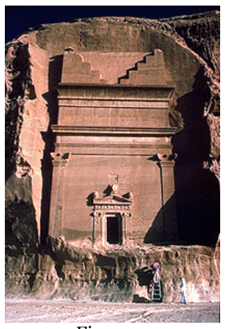
Figure 4. Madain Saleh, one of the few temple remains of Arabia's Vedic past

By now the first pilgrimage season after the Muslim Occupation of Mecca had come round. Muhammad came up with new revelations which were read out to the assembled crowds at Mina. In short, the declaration was that idolaters had four months in which to convert, after these 4 months, Muhammad was free of all responsibilities towards them. They would be attacked, killed & plundered wherever they were found. Next he stipulated in the usual cruel manner, that only Muslims could attend the pilgrimage, henceforth non-muslims would not be allowed to enter the confines of Mecca. With this the Prophet snatched away one of Sanatan Dharma's holy shrines and closed it from the world forever. In my next article I will relate the subsequent horrors committed by Muhammad in the name of Islam.