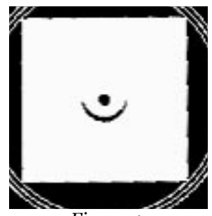
Figure 4. Cit-Kunda-Yantra the Tantric pattern that the Kaaba is based upon.