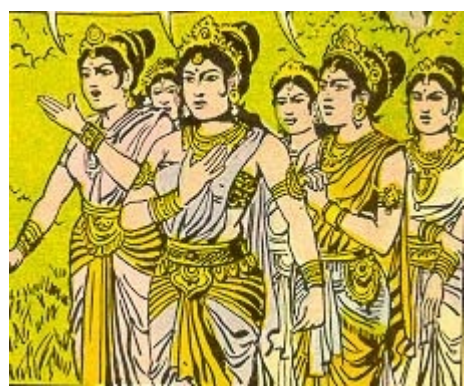
Figure 2. The six celestial sisters called Krittikas represented a cluster of six stars, called the Pleaides by the Greeks

360 shrines represented the days of the year and each image was made to symbolically represent the ruling planet, in astrological terms. The seven circambulations (parikrama) symbolized the orbiting of the seven major planets. The first three circuits were done fast and the remaining four slowly, in exact imitation of the planetary movements around the sun.