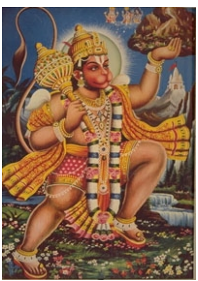
Figure 1. The Pre-Islamic deity "Hubal" was derived from the red skinned Ba-Hubali, another name for Lord Hanuman

His attention then turned to the large statue of Hubal on the roof of the temple. Hubal is none other than Ba-Hubali, another name for Hanuman. The First Encyclopaedia of Islam relates that "Hubal was an idol, made of red carnelian, in the form of a man". These clues cannot be overlooked. Anybody who is familiar with Hindu temples knows that BaHubali (Hanuman) is the great Monkey God, the son of the Wind-God. He is always represented in red, and adorns the roof of the temple pinnacle. This is because in the great Hindu epic Ramayana, BaHubali was rewarded for his great devotion to Lord Rama, by being accorded the privilege of always carrying the Hindu flag, which is poised on the pinnacle of temples. Thus the image of Hubal, was none other than the red colored image of BaHubali holding the saffron "Dhvaj" or flag of Hinduism on the roof of the Kaaba temple.