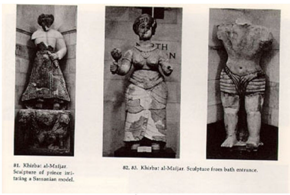
Figure 2. Sculptures of Pre-Islamic gods

This was the last straw. The Meccans were now convinced of the lies perpetuated by Muhammad. Their chieftains said: