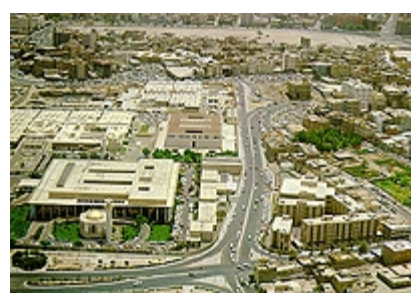
Figure 2. Present day town of Taif, still famous for its superb grapes

The city of Taif was principally famous for its gardens & vineyards. Due to its location among the mountains, the city had a temperate climate that was ideal for growing grapes and pomegranates. Taif was famous for these fruits as well as for honey. Muhammad set out with his army and besieged the city. But a few catapults and the siege of a prosperous fortified city such as Taif were not going to affect the courageous Thaqeef. After eleven days of the siege had passed, they calmly sent out a messenger to tell Muhammad that the city had enough rations to last them 2 years of siege. An enraged Muhammad then made an exceptionally cruel decision. The Prophet decided if he couldn't have the spoils of Taif, no one else could and therefore "ordered his glorious companions to fell the date trees and to destroy every vineyard of this place". Such an action is equivalent to mass murder in the dry environs of Arabia where it is difficult to find vegetation. Thus a unique ecosystem that had been carefully nurtured by the sweat and blood of the brave Thaqeef was ruthlessly obliterated. They were left with heaps of ash in place of the fruit of years of hard work, thanks to the "Messenger of Peace"! After a fortnight Muhammad had to raise the siege on Taif. An enraged & frustrated Muhammad swore that he would teach a bitter lesson to the Thageef who had defied him so persistently. He was forced to retreat and head back towards Medina.