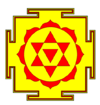
Fiaure 1. A tantric pattern which defines the structure of Kaaba

Muhammad's uncle was one of the resident priests of the Shiv temple known as "Kaaba". This sacred sanctum was decorated in an extremely rich and beautiful fashion. The Kaaba was astronomically oriented to face the winds. The minor axis of the rectangular base of the Kaaba was solistically aligned towards summer sunrise and winter sunset. It contained 360 statues of Vedic deities and was a shrine primarily associated with sun worship. The temple was an architectural representation of an interlocking set of theories covering virtually all creation and comprehending chemistry, physics, cosmology, meteorology and medicine. Each wall or corner of the Kaaba was associated with a specific region of the world. Thus this glorious Hindu temple was made to symbolically represent a microcosm of the universe. The Arabs would face east when praying. This representation of a microcosm demonstrated by the eight directional structure was derived from the Tantric pattern (Refer to Figure 1) of Hinduism. Right at the centre of the Kaaba was the octogonal pedestal of Bramha the creator. Today this very pedestal is called Magam-E-Ibrahim by the Muslims.