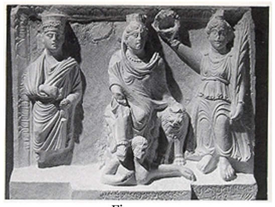
Figure 3. Allat of Palmyra

The consistent appearance of Temples dedicated to the divine couple of Shiva-Shakti throws light on the essential spiritual principles that the Hindus of Pre- Islamic Arabia upheld. Numerous instances support the preeminence of Shiva-Shakti worship in Arabia. The most obvious example is that of the Kaaba in Mecca.