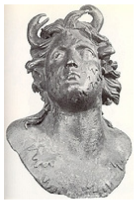
Figure 5. Du-Shara, the, Nabataean version of Lord Shiva.

Du-Shara wielding a trident along with his consort Al-Uzza seated on a lion, surrounded by dolphins. The entire divine scene thus symbolized Shiva-Shakti and the shape of the spatial universe as envisioned by Vedic culture..