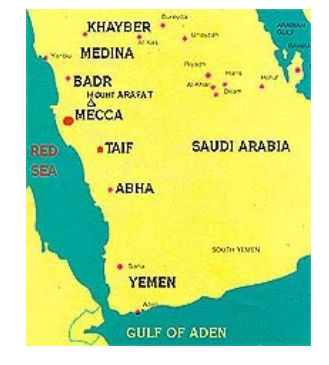
Figure 1. Map of areas in Muhammad's path of conquest

The brave Hawazin numbering 4,000 hid out in the ravines around the valley of Hunain and lay in wait. As the Muslims poured down the valley in the twilight of dawn, men suddenly sprang out from the hills on both sides & took them completely by surprise.