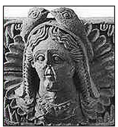
Figure 3. Al-Uzza as the Fish Goddess

The Battle of Badr had given Muhammad the wealth to bribe more people into accepting Islam. In addition the increase in power enabled the Muslims to rule by terror. Even the same Jews who had helped the Muslims in their moments of deepest crisis with food as well as military assistance, were subjected to conversion by the sword or not spared. Muhammad's reign of terror continued with the Battle of Uhud, Khayber and numerous other expeditions which helped the Muslims to gain Booty and slaves. Most of these slaves were women and children, These were victimised and raped. Khayber was a settlement of neutral Jews who were known for their business acumen. Muhammad simply had to satisfy his greed, by attacking this peaceful settlement. Although the Jews fought bravely, they could not stop the Mob of Muslims, who were in a bloodthirsty frenzy of Greed. The Prophet forced another Jewess Safia Bint Huyay to convert and marry him, in exactly the same manner as Rehaina Bint Amr. She had to watch her Husband, father and brother hacked to pieces before her eyes. Immediately after the battle, the Prophet's eye fell on this woman of intense beauty, and he threw his cloak on her to claim her as his booty. Indeed the Prophet had committed himself to saving widows in need by marrying them! The remaining women and children who were'nt attractive enough to keep as personal slaves, were rounded up to be traded in the slave market or retained to be brought up as brainwashed servants of Islam.