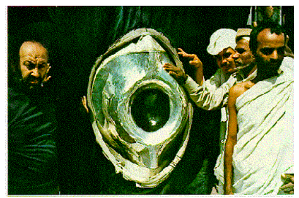
Figure 1. The Shiv Ling at The Kaba. It was broken in seven places and now is held together by a silver band.

holy Vedic custom which convert Muslims are inadvertently perpetuating. But in doing this they delude themselves and mislead others that these foot-impressions which are on reverential display in several mosques and tombs around the world are in fact Muhammad's own. There are several snags in this argument. Firstly worshipping a foot -impression amounts to idolatry and should therefore be taboo for a true Muslim. Secondly Muhhamad disclaimed having performed any miracles. Therefore there can be no foot-impression of his on stone. Thirdly foot-impressions must always be in pairs like shoes. Yet in most of these shrines, it is usually a single footprint which suggests that Muhammad walked on only one foot. Another question that crops up is whether the foot-impression is of the same size and foot in all the shrines. The fact appears to be that when the Vedic Kaba shrine in Mecca was invaded by Muhammad, the pairs of foot impressions of Vedic deities there were plundered and later traded to the gullible and devout as Muhammad's own footprints for some favour, reward or personal gain by unscrupulous muslims. That is why they are single and not in pairs.