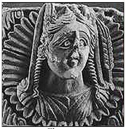
Figure 1. Al-Uzza as the Grain Goddess

Thus it was on the night of 15th June, 622 AD, that an embittered and vengeful Prophet of Islam fled for his life from Mecca in the dead of night. The Prophet could not conjure up any angels or miracle to freeze the Meccan's swords, instead it was a terrified and panicky man who slipped out in the safe blackness of night to escape from the people who had had enough of his intolerance and disrespect for the religion of their ancestors. On the way he was joined by small bands of highwaymen and nomads who belonged to his group of followers. They numbered 76 and of these, only 3 were women because the women of Mecca had blatantly rejected the religion preached by the Prophet for the simple reason that they enjoyed complete independence and equality within their own Vedic religion and society.