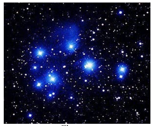
Figure 1. The Pleaides Constellation

The Prophet, who was apparently not very creative, subverted the meaning and purpose of the Hajj or pilgrimage in his usual fashion. Muhammad in a deliberate attempt to suppress this association with the Hindu solar rites changed the time of prayer to after sunset and before sunrise, when the sun was not visible! Thus what used to be a time of prayer inundated with love for nature and reverence for existence, was distorted into a fear-filled ceremony of throwing stones at imagined devils and insidiously connected to falsified historical accounts about the Semitic Prophet Abraham.