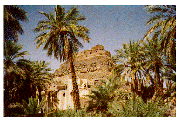
Figure 2. Khayber - The Jewish Settlement which was besieged by Muhammad and his followers

The Battle of Badr had given Muhammad the wealth to bribe more people into accepting Islam. In addition the increase in power enabled the Muslims to rule by terror. Even the same Jews who had helped the Muslims in their moments of deepest crisis with food as well as military assistance, were subjected to conversion by the sword or not spared. Muhammad's reign of terror continued with the Battle of Uhud, Khayber and numerous other expeditions which helped the Muslims to gain Booty and slaves. Most of these slaves were women and children, These were victimised and raped. Khayber was a settlement of neutral Jews who were known for their business acumen. Muhammad simply had to satisfy his greed, by attacking this peaceful settlement. Although the Jews fought bravely, they could not stop the Mob of Muslims, who were in a bloodthirsty frenzy of Greed. The Prophet forced another Jewess Safia Bint Huyay to convert and marry him, in exactly the same manner as Rehaina Bint Amr. She had to watch her Husband, father and brother hacked to pieces before her eyes. Immediately after the battle, the Prophet's eye fell on this woman of intense beauty, and he threw his cloak on her to claim her as his booty. Indeed the Prophet had committed himself to saving widows in need by marrying them! The remaining women and children who were'nt attractive enough to keep as personal slaves, were rounded up to be traded in the slave market or retained to be brought up as brainwashed servants of Islam.